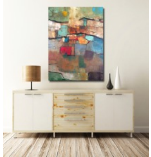
Homestead, 48" x 36" Mixed Media