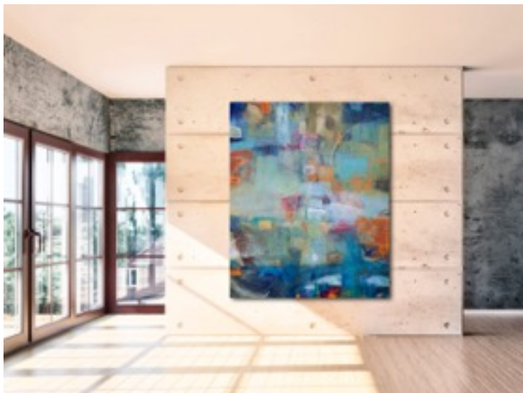
Crazy Love, 60" x 48" Mixed Media