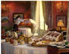
Clearing Away the Breakfast Things O/C 11" x 14"