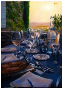
Table View of the Sunset over Provence O/C 18" x 25"