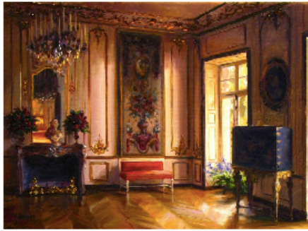
Gilt and Shadows in Late Afternoon O/C 9' x 12"