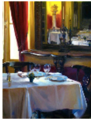
Antiquity of La Penelope, Paris O/C 24" x 18"