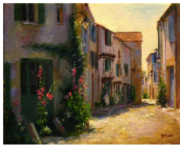
Curving Lane on Ile de Re, France O/C 8" x 10"